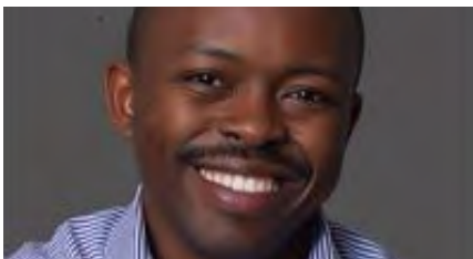
James Irungu Mwangi

James Musoni is the Minister of Infrastructure in the Government of the Republic of Rwanda. Before his current position, he was Minister of Local Government (2009–2014); Minister of Finance and Economic Planning (2006–2009); Minister of Commerce, Industry, Investment Promotion, Tourism and Cooperatives (2005–2006); Commissioner General of Rwanda Revenue Authority (2001–2005) and Deputy Commissioner General of Rwanda Revenue Authority (2000–2001). He has an MBA in finance from Newport International University, California, and a BCom, Finance, from Makerere University, Kampala, Uganda. He also holds a Certificate in Public Finance Management Executive Course from the Harvard Kennedy School.