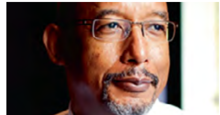
Ibrahim Mayaki New Partnership for Africa's Development

Carlos Lopes leads a staff of around 1,000 at the Economic Commission for Africa. He has more than 24 years of senior leadership experience at the UN. He has authored or edited 22 books and taught at academic institutions all over the world. Selected as one of the most influential Africans several years in a row by New African and Financial Afrik , he is a frequent commentator on CNN, Al Jazeera, the BBC, France 24 and in Le Monde and the Financial Times . His Op-Eds are published on average 30 times a month in the pan-African media and he has around half a million monthly impressions from his social media.