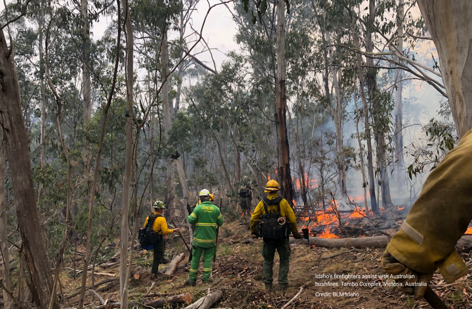
Idaho's firefighters assist with Australian bushfires. Tambo Complex, Victoria, Australia