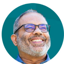
Mr. Carlos Lopes Guinea Bissau