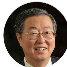
Dr. Zhou Xiaochuan China