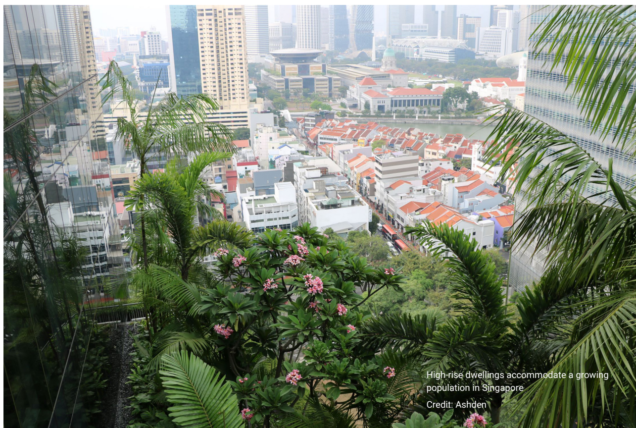
High-rise dwellings accommodate a growing population in Singapore